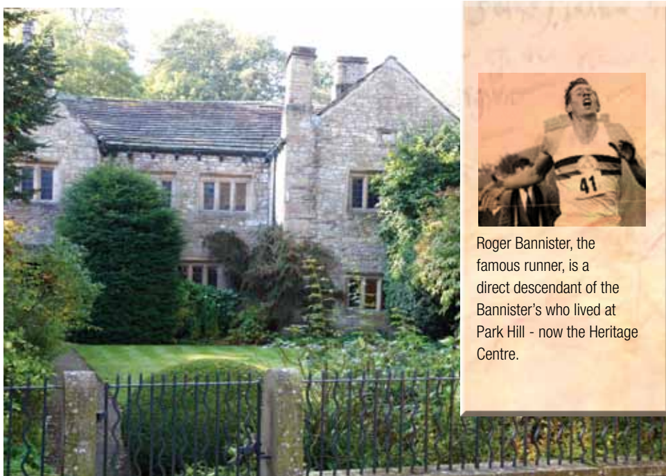
Roger Bannister, the famous runner, is a direct descendant of the Bannister's who lived at Park Hill - now the Heritage Centre.

The Heritage Centre is the start of your journey for walks 1 & 3.