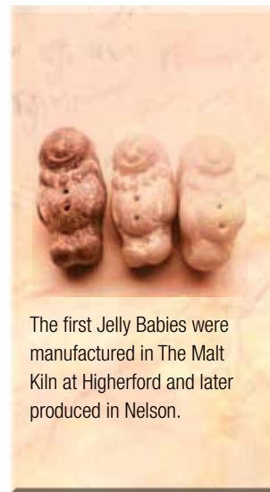
The first Jelly Babies were manufactured in The Malt Kiln at Higherford and later produced in Nelson.

28. Just beyond the Old Bridge Inn past the farm entrance, is a tight opening to a delightful riverside footpath that takes you back to the Heritage Centre car park.