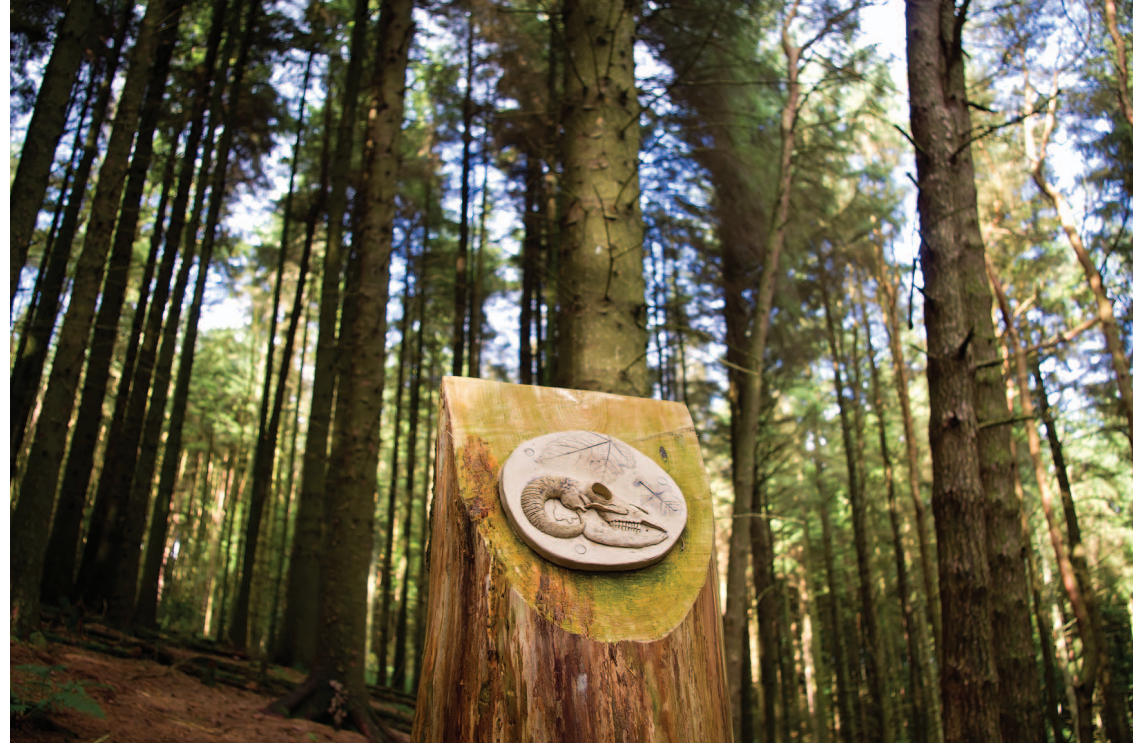
A Witches Plaque

There's even a beautifully carved life-size figure of a witchfinder by Martyn Bednarczuk . This sculpture has overtones of the local magistrate, Roger Nowell, who first interrogated the Pendle villagers who later became famous as the Pendle Witches.