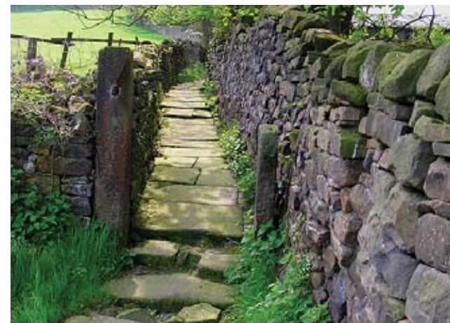
Flagstone path up from Carry Bridge

This circular walk follows public rights of way across farmland and other privately owned land. Please respect people who live and work in the countryside. Be prepared for muddy stretches, uneven path surfaces and weather conditions which change suddenly.