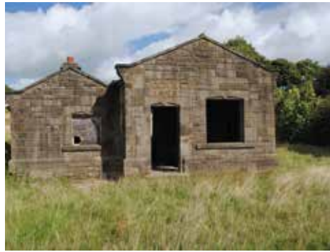
Old Pump House