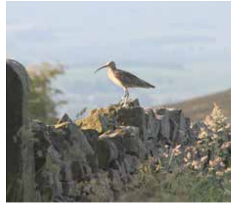
Curlew, often seen and heard on The Rough during nesting season

Of Anglo-Saxon origin, Lidgett means "animal or livestock gateway" and it was traditionally an area on the very fringe of settlements and pasture land. Along with the nearby settlement of Bents, Lidgett is designated as a Conservation Area and the two hamlets are described in the appraisal as "a very attractive rural place at the edge of Colne". Within Lidgett we can see the Grade II Listed buildings of the Turnpike House, adjacent to the roundabout and, higher up on the opposite side of the road, the 1749 former Lidgett Hall, surrounded by handloom weavers' cottages, with Heyroyd House further up the road. Several of these cottages are three storey, with pairs of loomshop windows to the first and second floors.