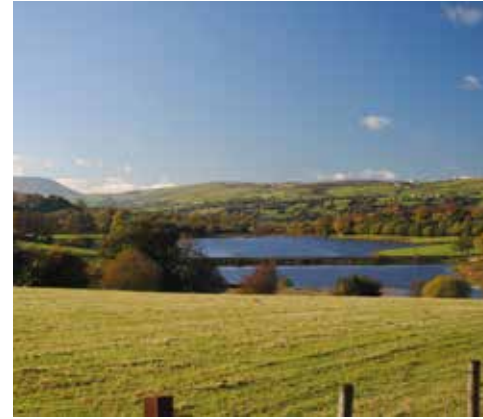
Foulridge Upper Reservoir