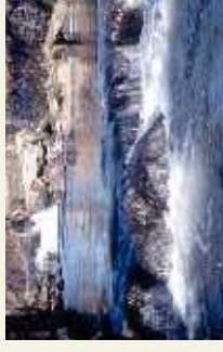
Pendle Water, Higherford

For dates and further details contact Barnoldswick (01282) 813751 or 865626.