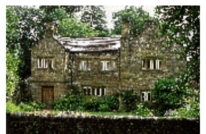
Pendle Heritage Centre