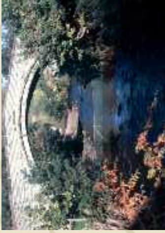
Old Bridge, Higherford

The Pendle Way covers a variety of terrain and you are likely to encounter some muddy stretches. Weather conditions can change suddenly so be prepared for all eventualities.