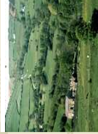
Blacko Foot Farm and Burn Moor

Waterside - Marsh Marigold, Monkey Flower, Butterbur Moorland - Heather, Heath Bedstraw, Cotton Grass