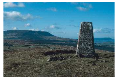
Triangulation point at Weets Hill